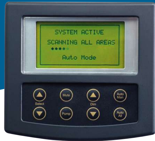
Actual Size = 126 x 116 x 21mm