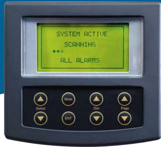
Actual Size = 126 x 116 x 21mm